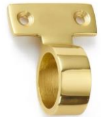
RING SASH LIFT