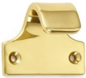
HOOK SASH LIFT

Generally 2 lifts per sash required. For narrow windows (250mm or less) 1 lift fitted centrally may be acceptable.