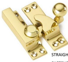
STRAIGHT ARM FASTENER