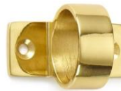
FACE RING SASH LIFT