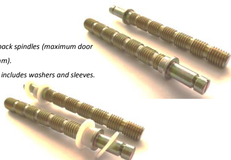
Supplied with M10 back to back spindles (maximum door thickness 60mm). Glass door kit includes washers and sleeves.

BACK TO BACK – Timber or Glass doors. A pair of pull handles, one on each face of the door. It is essential the door type (timber or glass) is specified when ordering.