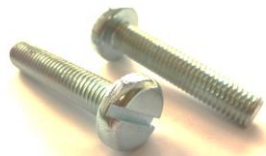
Supplied with M10 x 50mm pan head bolts

For glass door applications consider the S7555 decorative cap to cover the head of the fastener.