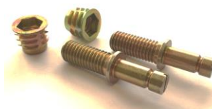
Supplied with Threaded inserts for timber and M10 face fix spindles 50mm pan head bolts

FACE FIX – Timber doors only, minimum door thickness of 30mm required. A single pull handle on one face of the door only; no fasteners visible on opposing face of door.