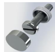
S7555 decorative cap option for covering M10 fastener head