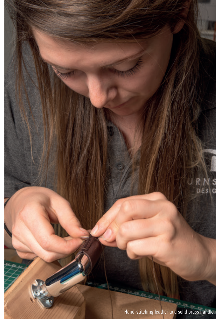
Hand-stitching leather to a solid brass handle.

Turnstyle Designs is a specialist when it comes to making bespoke handles. The craftsmen and women at the Barnstaple-based factory have produced every kind imaginable for applications as diverse as kitchens, hotels and luxury yachts. 25 years in the business, and recently crowned winners