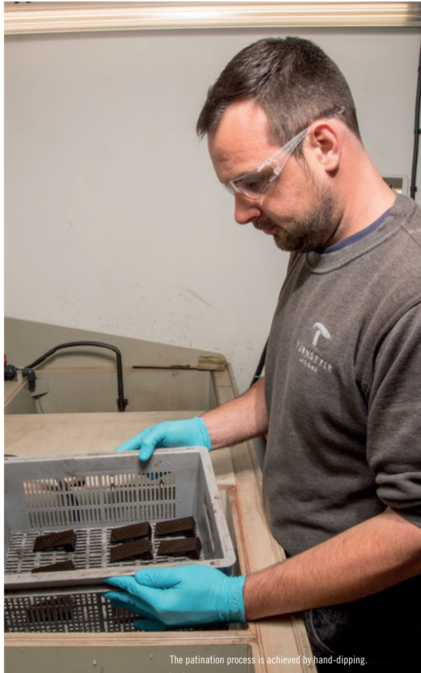
The patination process is achieved by hand-dipping.

"We can work in any of three ways," continues Stephen. "We have a standard catalogue and every handle in it is available in a choice of 48 material and grip options. These are made to order and usually shipped within ten days. Often, customers will use these existing designs as a base for their own ideas and ask us to customise examples they've seen in the catalogue, or on the website, maybe by changing the colour of the Amalfine grip, the metal finish, the length of the handle, or the stitching. Making customised versions of our designs accounts for about 35% of our business but we can also work from a client's own ideas and create an entirely new design from scratch. Normally, we'd engineer a mock-up, then manufacture and test it using a variety of materials from brass and leather to glass