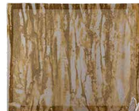
↑ Anapa 1 rug in semi-worsted wool and silk, from the Alpha Workshops II collection by Edward Fields, £12,085 for a 7.47sq m (80sq ft) rug, House of Tai Ping (020-7808 9650; http://taipingcarpets.com; http://edwardfields.com)

Finish with soothing shades of oatmeal, ecru, mahogany and umber-brown timber for the perfect blend of glow and glamour.