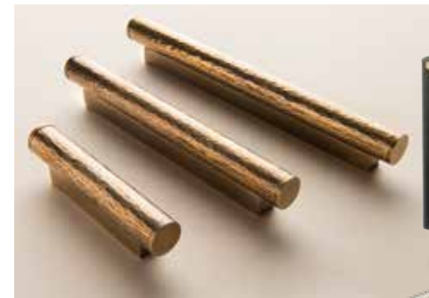
↑ Hammered scroll handles , from £109.50 each, Turnstyle Designs (01271 325325; www.turnstyledesigns.com)

Fabrics are as low-key as the materials themselves, embracing painterly brushstrokes and a neutral palette that works just as well across upholstery as for simple Roman blinds.