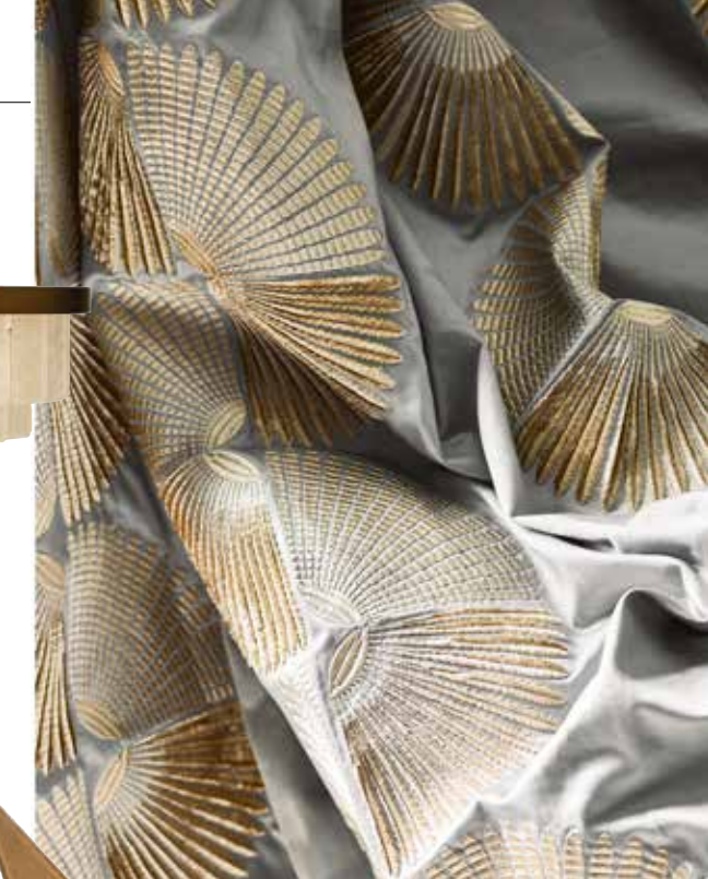
↑ Tamara fabric in silver/gold J890F-02 by Jane Churchill, £89 per m, Colefax and Fowler (020-7351 0666; www.colefax.com)