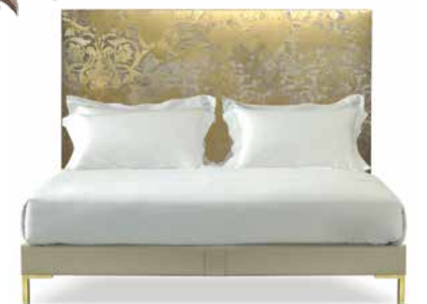
↑ Insley & Nash at Savoir bed in bespoke screen-printed fabric, from about £10,000, Savoir Beds (020-7352 0302; www.savoirbeds.co.uk)