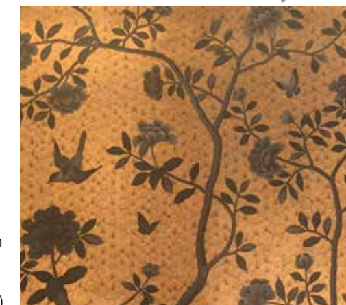
↓ Florent wall covering in intro, £428 per sq m, Fromental (020-3410 2030; www.fromental.co.uk)