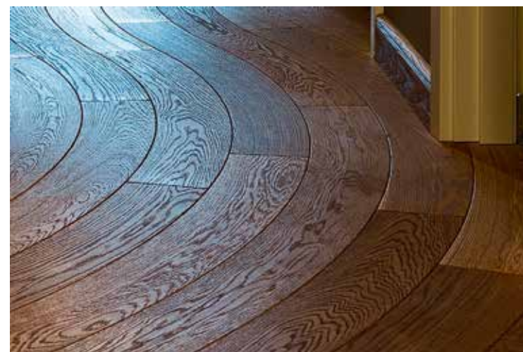
↑ Curved parquet flooring , from £300 per sq m, Topfloor By Esti (020-7795 3333; www.topfloorrugs.com)