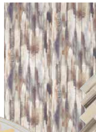
← Estrato 120579 fabric in Damson/Viola/Blush, £46 per m, Harlequin (0845 123 6805; www.harlequin.uk.com)