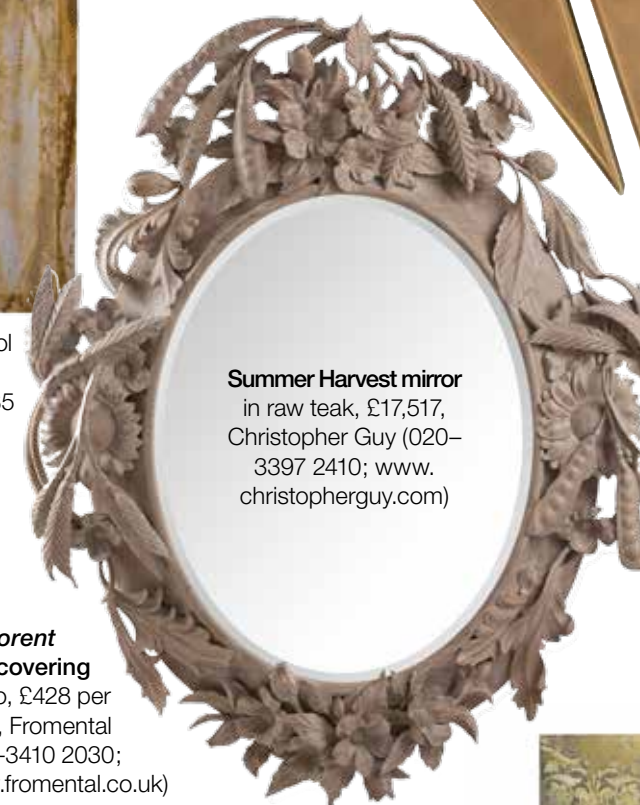
↑ Summer Harvest mirror in raw teak, £17,517, Christopher Guy (020-3397 2410; www.christopherguy.com)