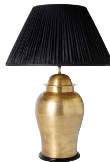
↑ Large Temple Jar table lamp in distressed brass with a wooden base and Honan silk Empire shade, £949, Besselink & Jones (020-7351 4669; www.besselink.com)