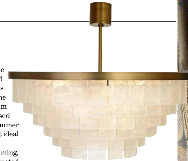
↑ CL125 Savile Row Chandelier 75cm (29.5in) diameter with a tiered frame and hand-carved Lucite tiles, £5,340, Bella Figura (020-7376 4564; www.bella-figura.com)