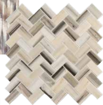
↑ Calacatta Zebrino marble in Large Herringbone mosaic , £385.38 per sq m, Ann Sacks (020-3055 0802; www.annsacks.com)

← Matte Gold Lotus Collection with 24-carat gold detail, a seven-piece set costs £850 (can also be bought individually), Elise Som (020-3845 1987; www.elisesom.com)